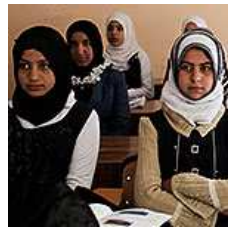
Iraq's Tribal Chiefs Deliver Swift Justice