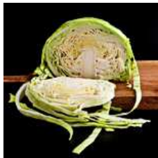
Cabbage Flexes Its Muscles Three Ways