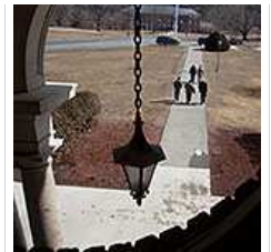
Community Weighs In On Campus Giveaway

For student-athletes, the madness is year-round. Room for Debate asks: Who is making sure they get an education?