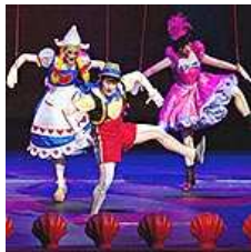
New York Stagecraft Plies the High Seas