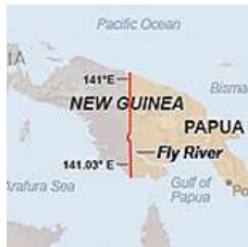
Borderlines: Who Bit My Border?