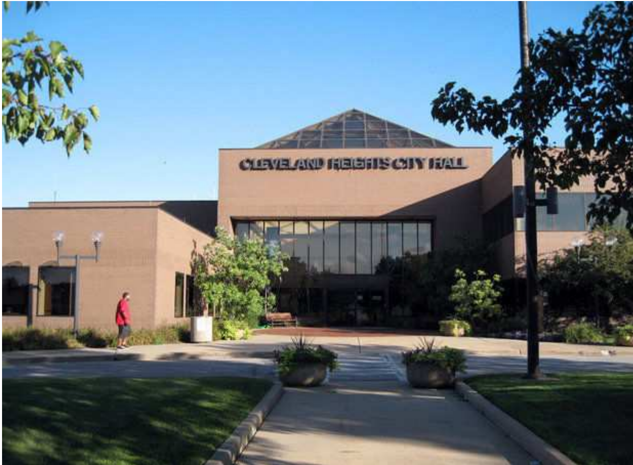
Cleveland Heights city officials are considering layoffs and not filling vacant positions to save money, and increasing court costs to generate more revenue. (File photo)