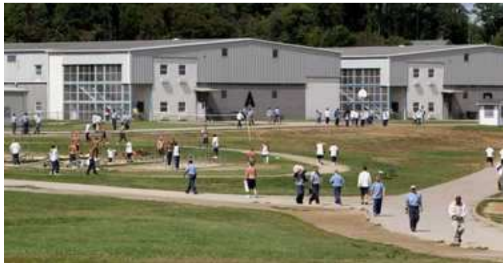
View full size ( http://media.cleveland.com/plain_dealer_metro/photo/ohio-prison-phone-callsjpg-eb9fc6a24070e1ea.jpg )

Though the FCC does not have jurisdiction to cap the costs of calls in Ohio's 28 prisons made to Ohio numbers, its potential ruling regulating interstate calls could influence how those communications are handled.